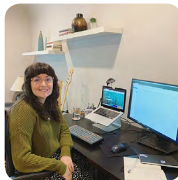
Capilano University Librarians working on AskAway from home.